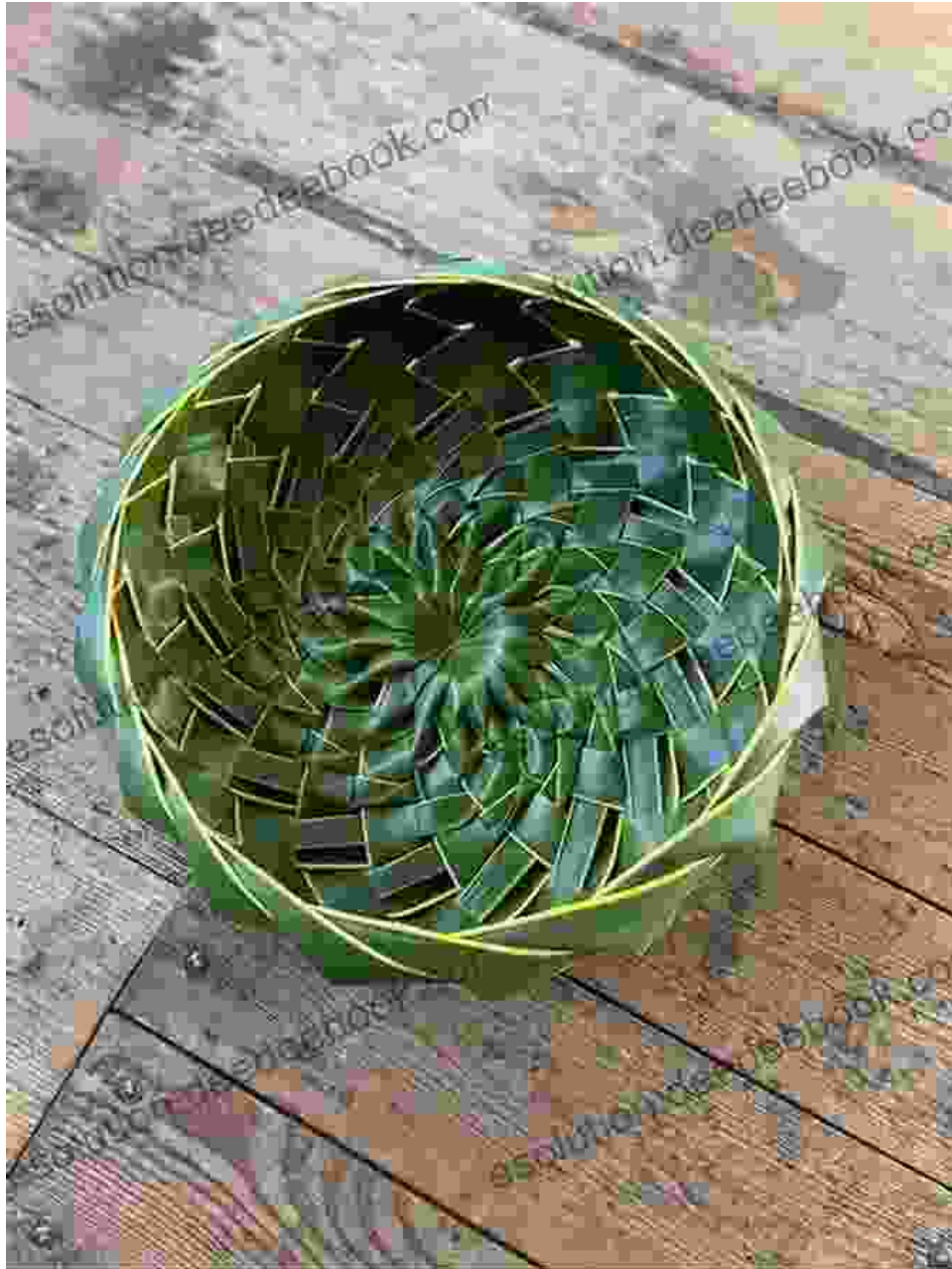
Maui Hatman style coconut palm basket