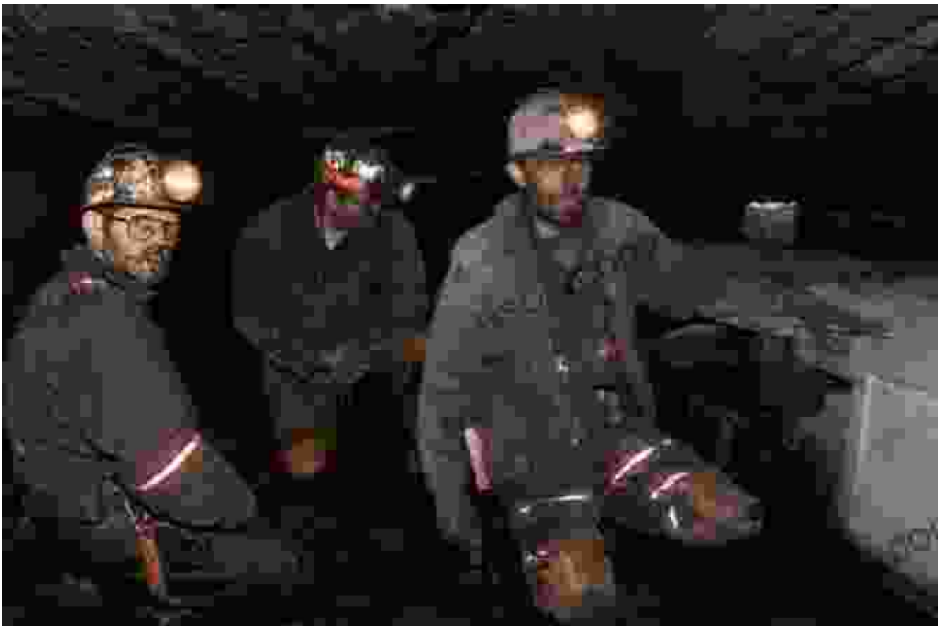
A scene from "Out of the Black" (2006)

The second film, "Out of the Black," delves deeper into Gippsland's industrial past, particularly the coal mining industry that shaped the region's economy and social fabric. Angus explores the impact of the industry on the environment and the workers who toiled in the mines, giving voice to their stories of hardship and resilience.