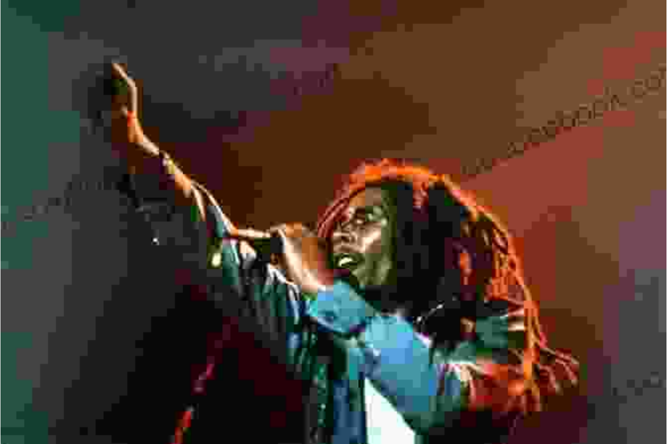
A group of Reggae musicians performing on stage

In Malawi, Reggae was used by musicians to challenge the status quo and to promote social and political change. One of the most prominent Reggae musicians in Malawi was Black Missionaries. Black Missionaries' music was known for its socially conscious lyrics and its infectious rhythms. They used their music to call for an end to poverty and inequality.