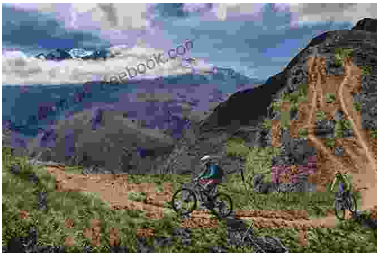
Mountain bikers riding on a trail in Bolivia.

Bolivia's varied terrain also makes it an ideal destination for mountain biking. From adrenaline-pumping downhill trails in the Andes to scenic bike paths along the shores of Lake Titicaca, Bolivia Pocket Adventures offers a range of mountain biking tours that cater to all levels of riders.